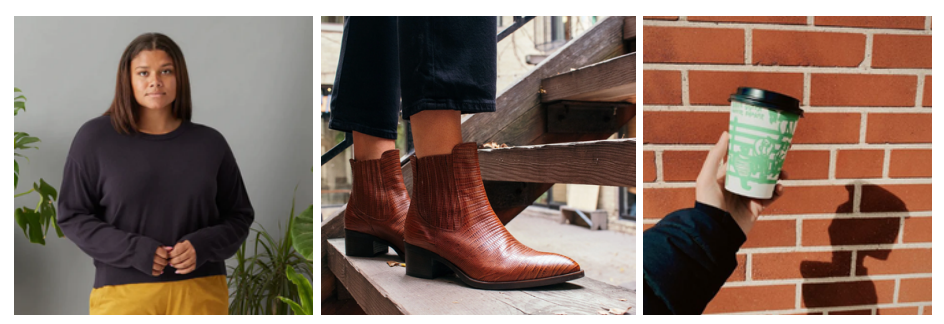
Palmer Sweater, $39.99, Out of the Blue, 102 Osborne Street

As we head into cooler temperatures, we can take comfort in all things cozy. It's time to grab a fall Cascara Spice Latté from Little Sister Coffee Maker (433 River Ave), throw on a sweater from Out of the Blue (102 Osborne St), and take a stroll through the neighbourhood in your new fall boots from Rooster Shoes (105 Osborne St). Osborne Village has plenty of fashion retailers to keep you cozy and stylish this season. Here are some looks we're loving: