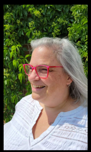
Eyes in the Village is located at 134 Osborne Street

The list goes on! For all of your legal needs, visit Fehr Manghebati Law (222 Osborne Street) and for help with your taxes, visit Liberty Tax Service (194 Osborne Street). More than shopping and eating, Osborne Village is for living—it's the perfect place to get things done. A wide variety of businesses are just a stone's throw from one another, making Osborne Village one of the best places in the city to support local businesses and to live an active (car-free) lifestyle.