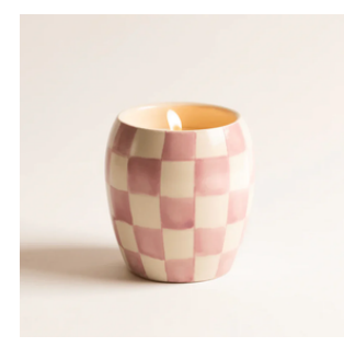
Checkmate Candle, $65.00, Small Mercies, 111 Osborne Street

This cozy season, make your home your happy place. Osborne Village shops have everything you need to stay warm as the weather outside cools. Glowing candles, hot tea, and summery plants are all available at our local retailers. Here are some of our favourite fall finds: