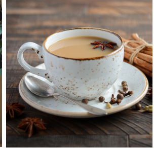
Chai 200g, $10.00, The Canister 121 Osborne Street