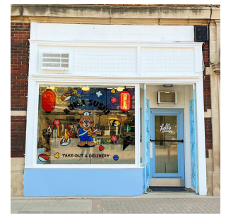
Kuma Sushi, 454 River Ave Fresh, delicious and affordable sushi right in the heart of the Village. Meet you for some Miso soup!

Innovative and creative delicious Korean style hot dogs. Made with rice flour. Chun derives from Chung Chun, Korea, and it means awesome or great. Which we agree with after tasting the hot dogs.